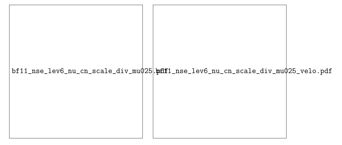
Figure 1: Left: numerical results for the velocity error, left-hand side of estimate (41), and the pressure error, integral term on the left-hand side of estimate (52) with p-p_h : different values of \nu for a fixed spatial grid. Right: individual contributions of the left-hand side of (41).